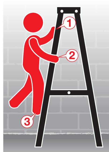
Figure 3: Maintain Three Points of Contact

To report a serious workplace injury, contact the 24/7 Occupational Health and Safety Emergency Line at 902-628-7513