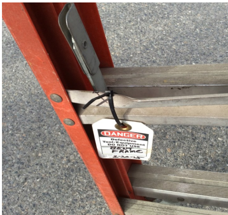
Figure 1: Identify & Discard Defective Equipment

As with all work, safe work procedures should be followed when using a ladder. Prior to using a ladder, you should perform a job hazard analysis to identify and address all hazards in the work area.